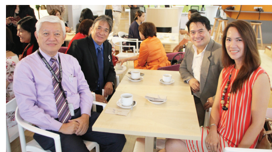
The Nest is where Financial Advisors can invite clients over for individual financial needs analysis and for pocket forums.