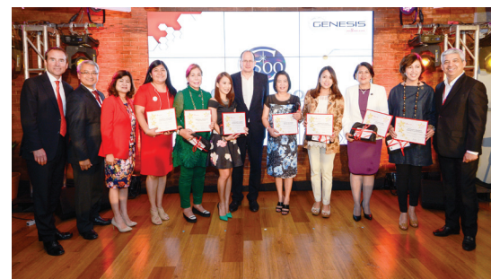
Philam Life MDRT Candidates for 2017 who successfully met the MDRT requirements as early as April 2016 receive recognition plaques from AIA and Philam Life top executives.