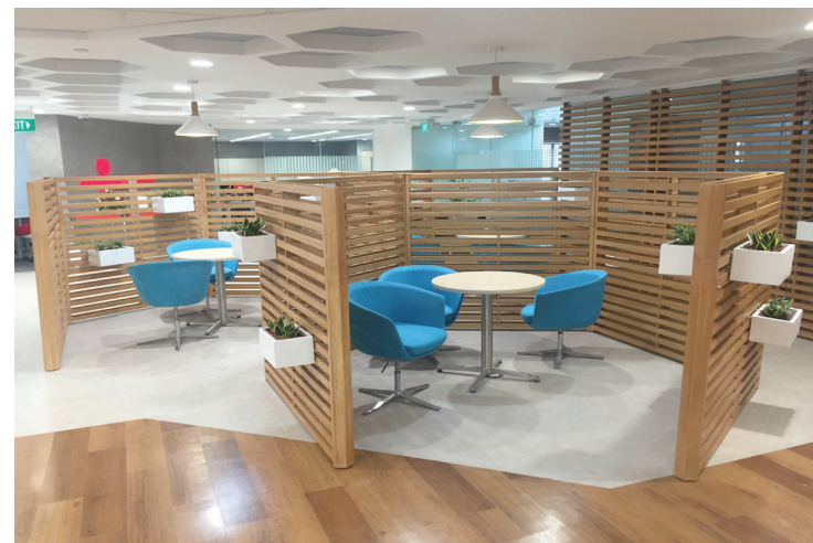
The Nest: Client Nook