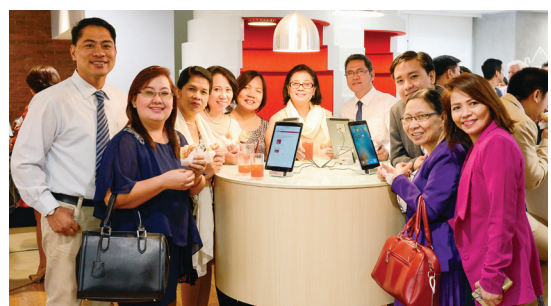
The Hive is equipped with the latest software, technological tools and sales support to enable Financial Advisors to achieve high levels of productivity.