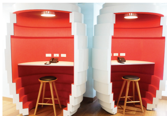
The Hive: Phone Booths