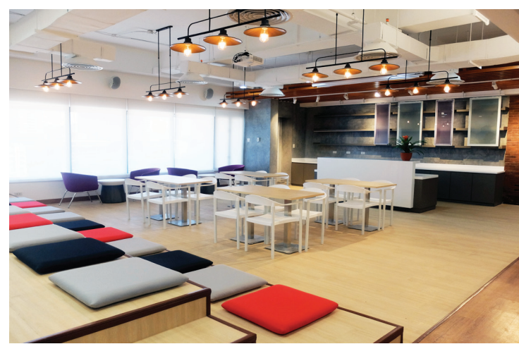
The Nest: Coffee Point