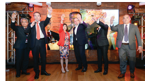
AIA Group and Philam Life executives toast to the start of greater things ahead for Philam Life.