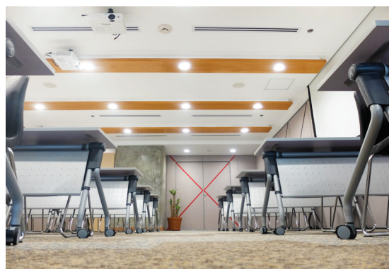
The Farm: Training Room