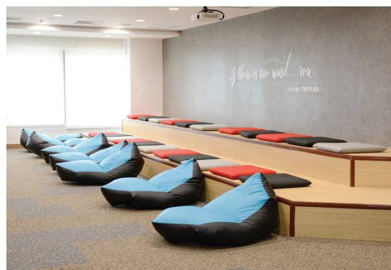
The Farm: Think Hub